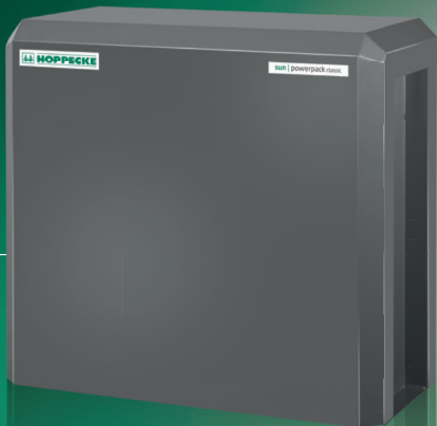
Similar to the illustration